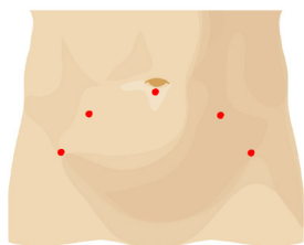
da Vinci® Prostatectomy Incision