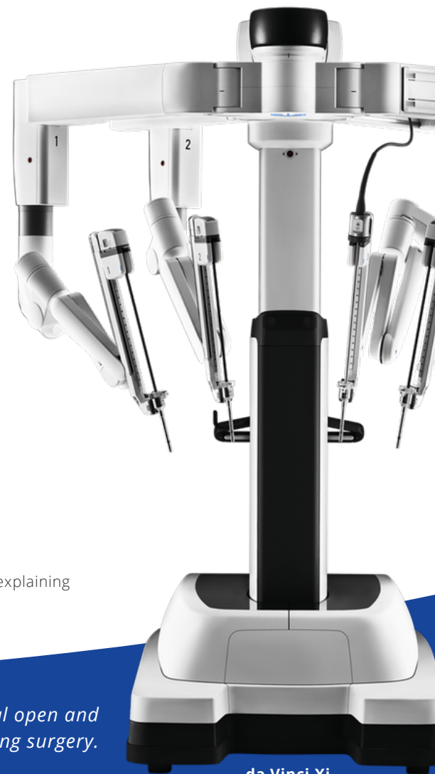
da Vinci Xi Surgical System

By overcoming the limitations of both traditional open and laparoscopic surgery, da Vinci is revolutionising surgery.